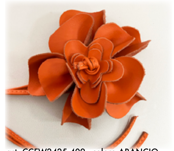
art. CCFW2425 409 - colore ARANCIO