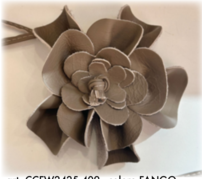
art. CCFW2425 409 - colore FANGO