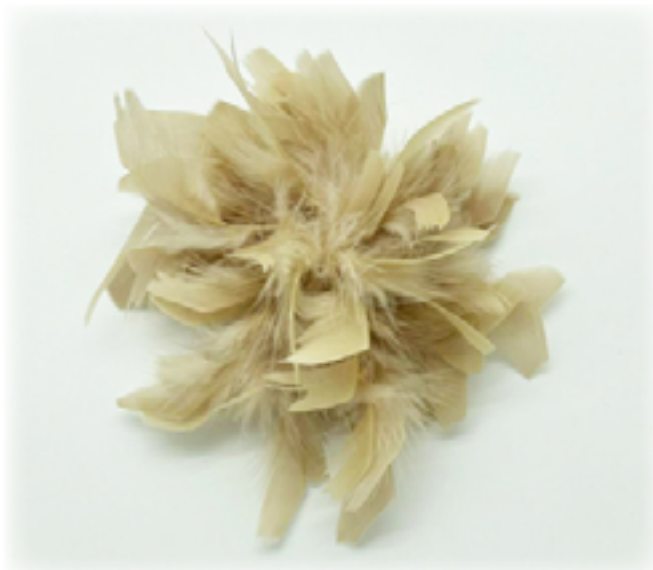
art. CCFW2425 404 - colore NUT