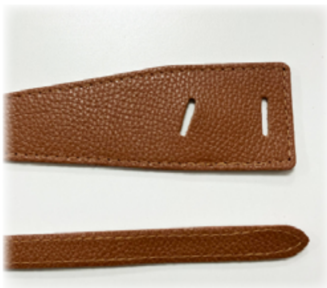
art. CCFW2425 406 - colore CUOIO