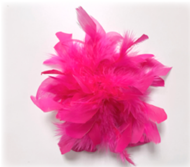
art. CCFW2425 404 - colore FUXIA