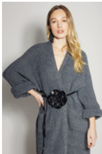
CAPPOTTO: CC4093 CINTURA: CC409