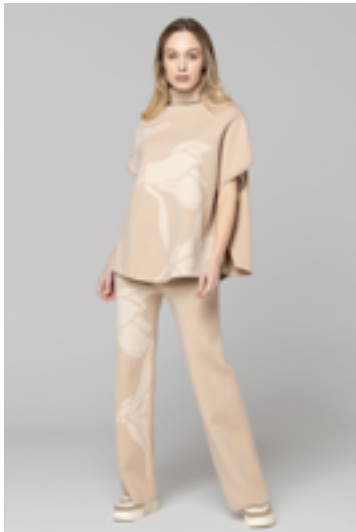
CASACCA: CC4037A PANTALONE: CC4038B