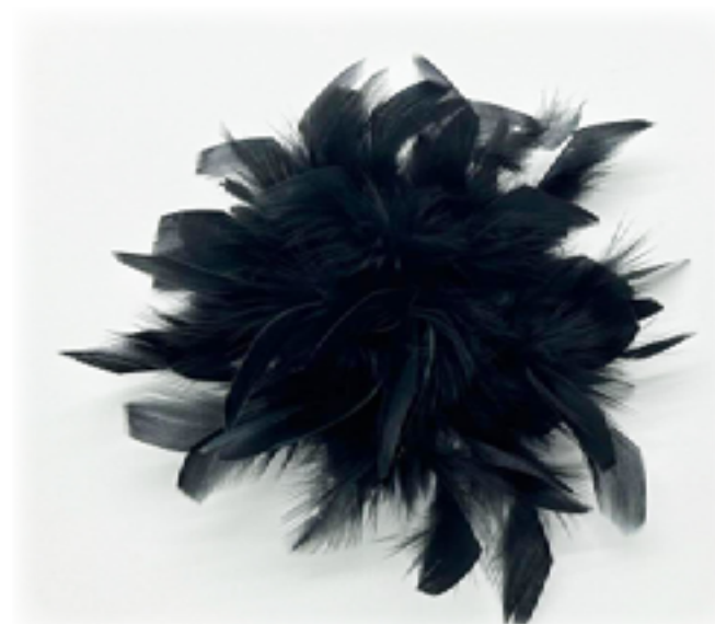
art. CCFW2425 404 - colore NERO