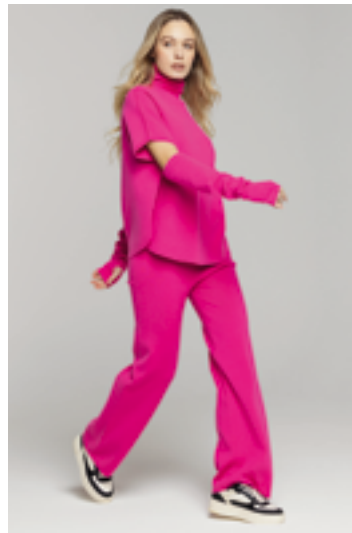
CASACCA: CC4005 PANTALONE: CC4006 MANICOTTI: CC4021