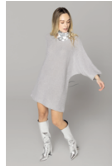
MAGLIA: CC4106 CINTURA: CC409