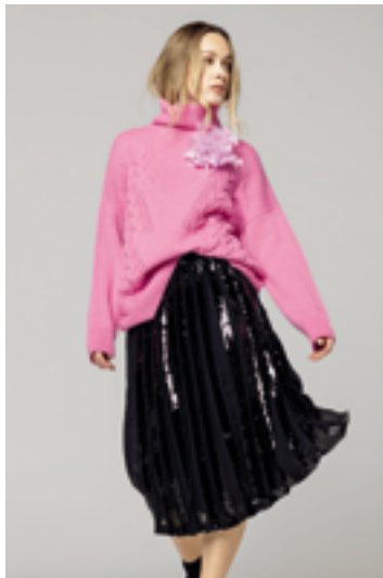
MAGLIA: CC4091 SPILLA: CC404