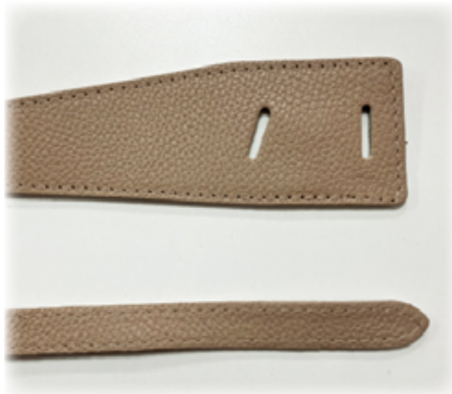
art. CCFW2425 406 - colore NUT