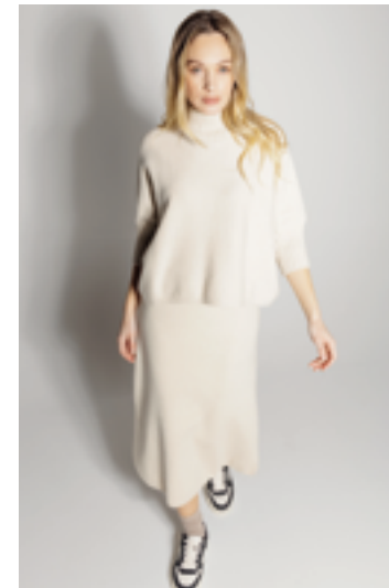
MAGLIA: CC4003 GONNA: CC4012