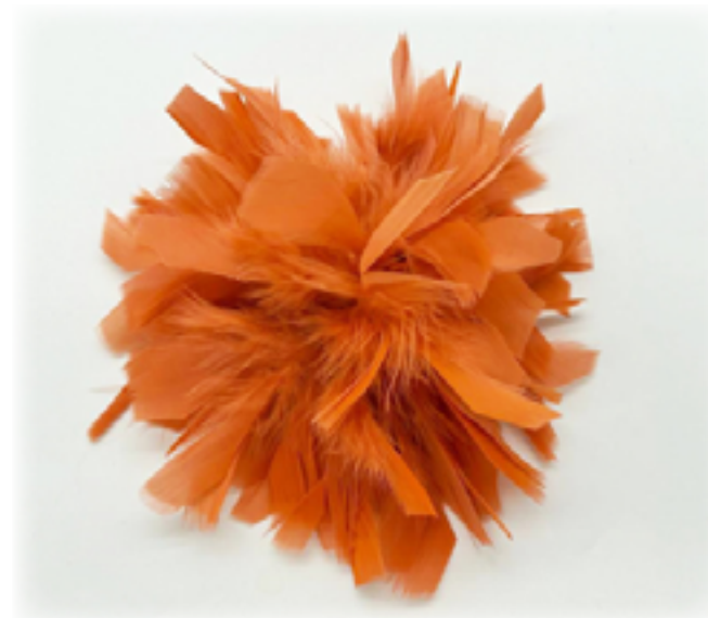
art. CCFW2425 404 - colore ARANCIO