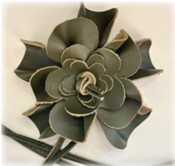
art. CCFW2425 409 - colore VERDE