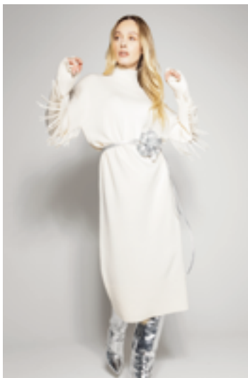
ABITO: CC4030 CINTURA: CC409