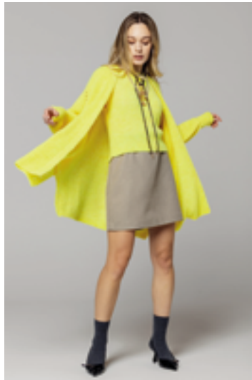
GILET: CC4104 CARDIGAN: CC4103