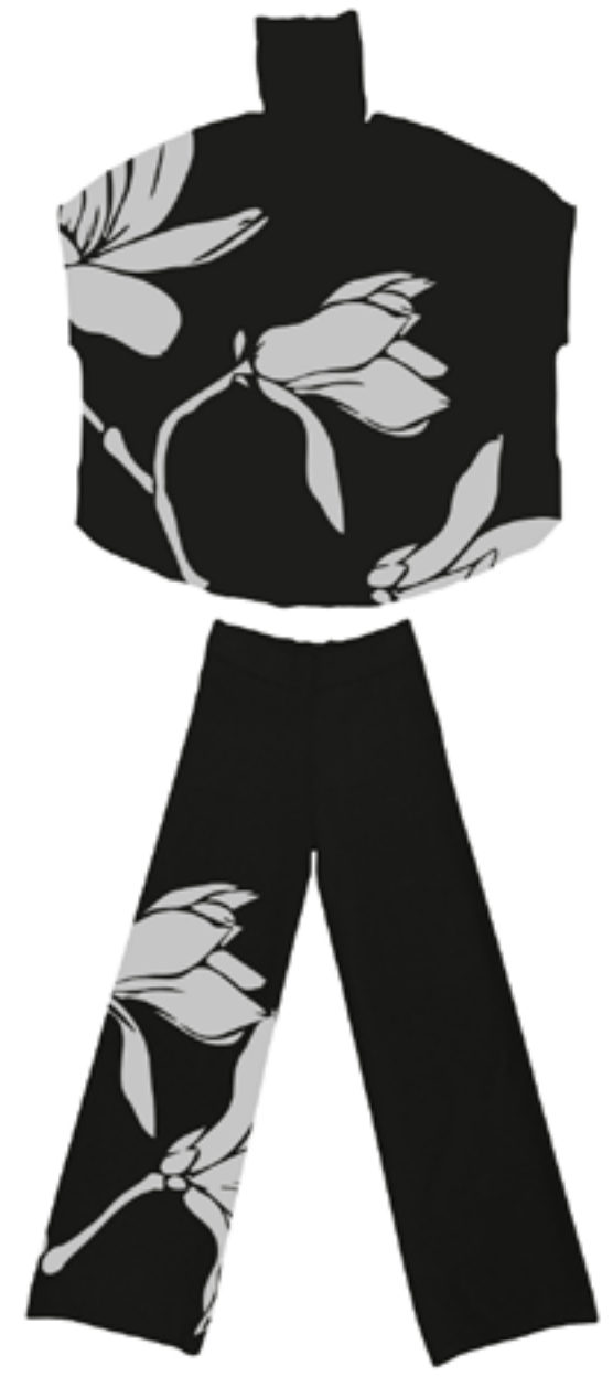
CASACCA art. CC4037A - var. NERO PANTALONE art. CC4038B - var. NERO