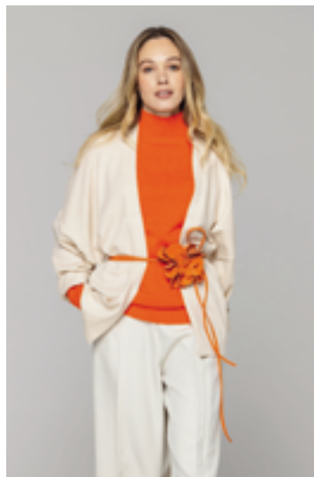
TURTLENECK: CC4034 CARDIGAN: CC4014 CINTURA: CC409