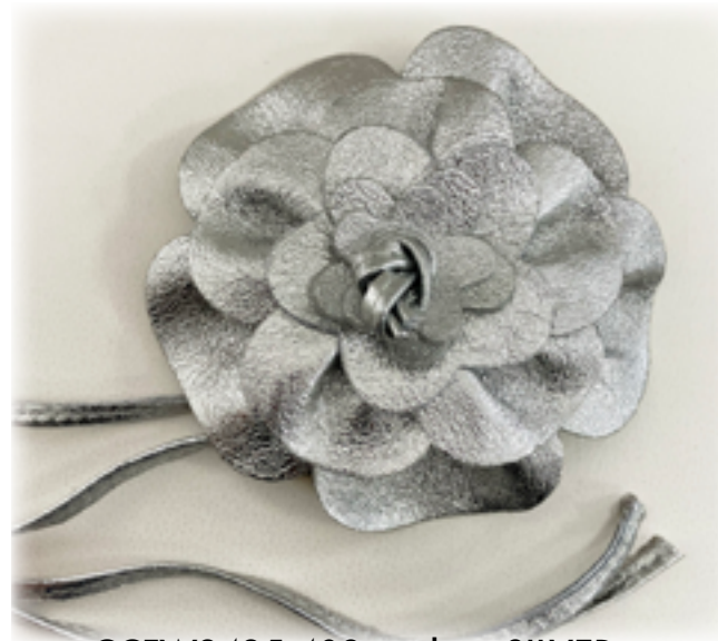
art. CCFW2425 409 - colore SILVER