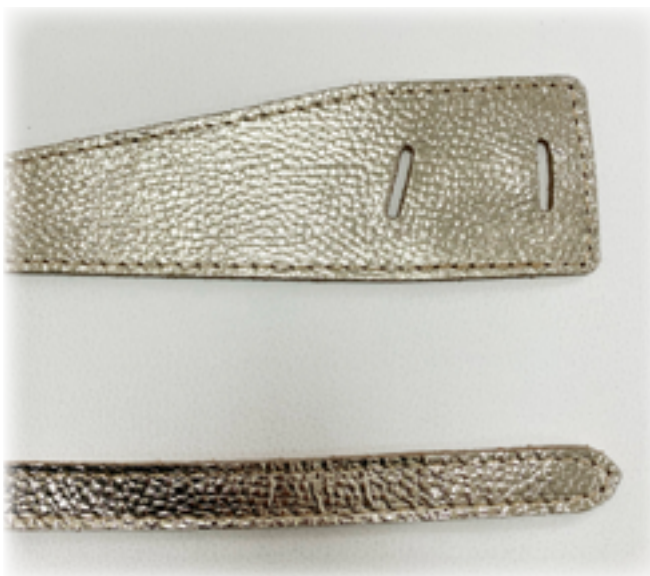
art. CCFW2425 406 - colore ORO