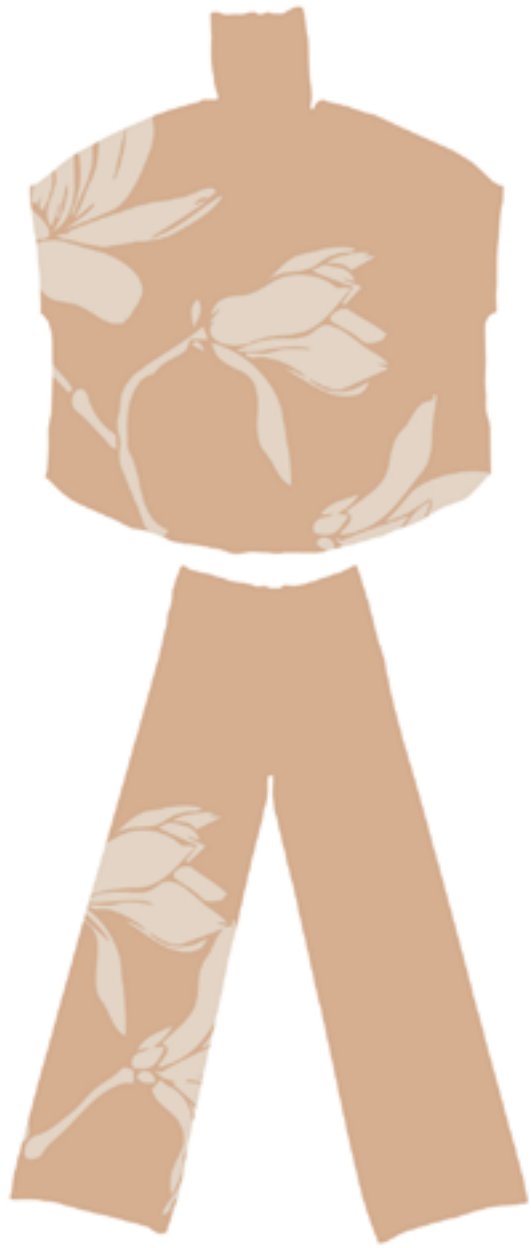
CASACCA art. CC4037A - var. NUT PANTALONE art. CC4038B - var. NUT