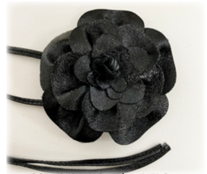
art. CCFW2425 409 - colore NERO