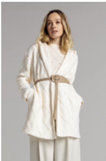
GIACCA CON CINTURA: CC4039 GIROCOLLO: CC4041