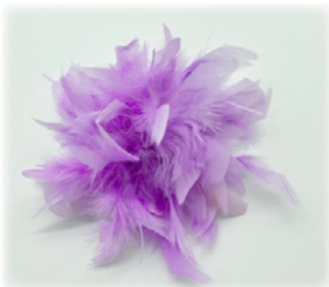
art. CCFW2425 404 - colore LAVANDA