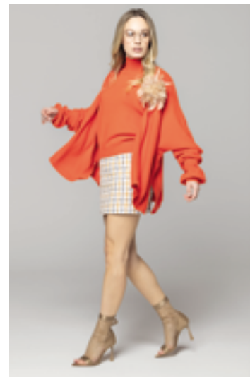
TURTLENECK: CC4004 CARDIGAN: CC4002 SPILLA: CC404