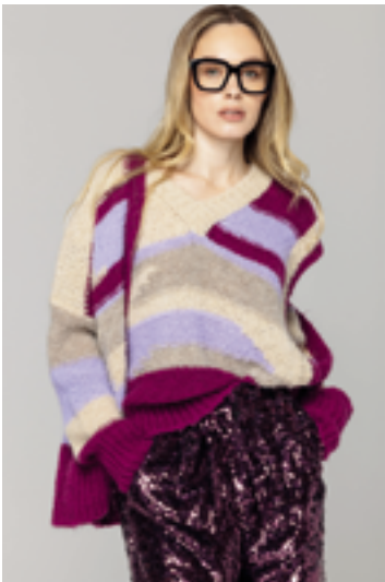
GILET: CC4100 CARDIGAN: CC4102