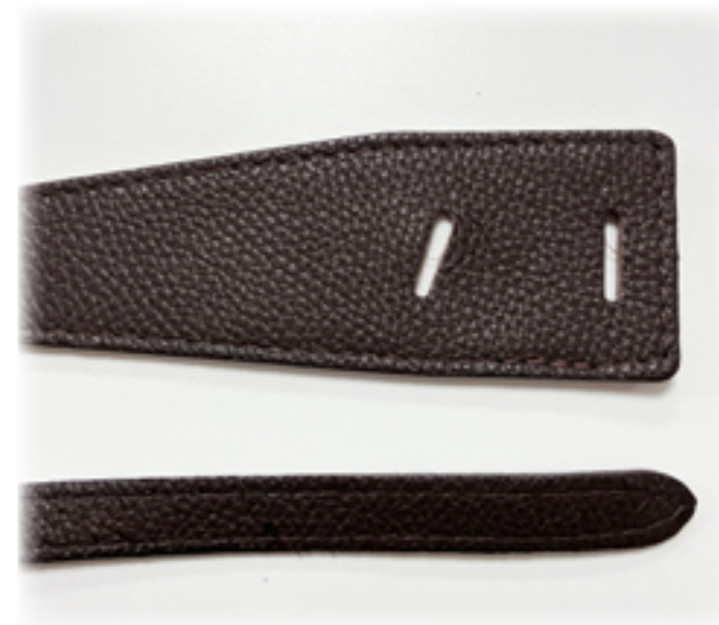
art. CCFW2425 406 - colore CAFFE'