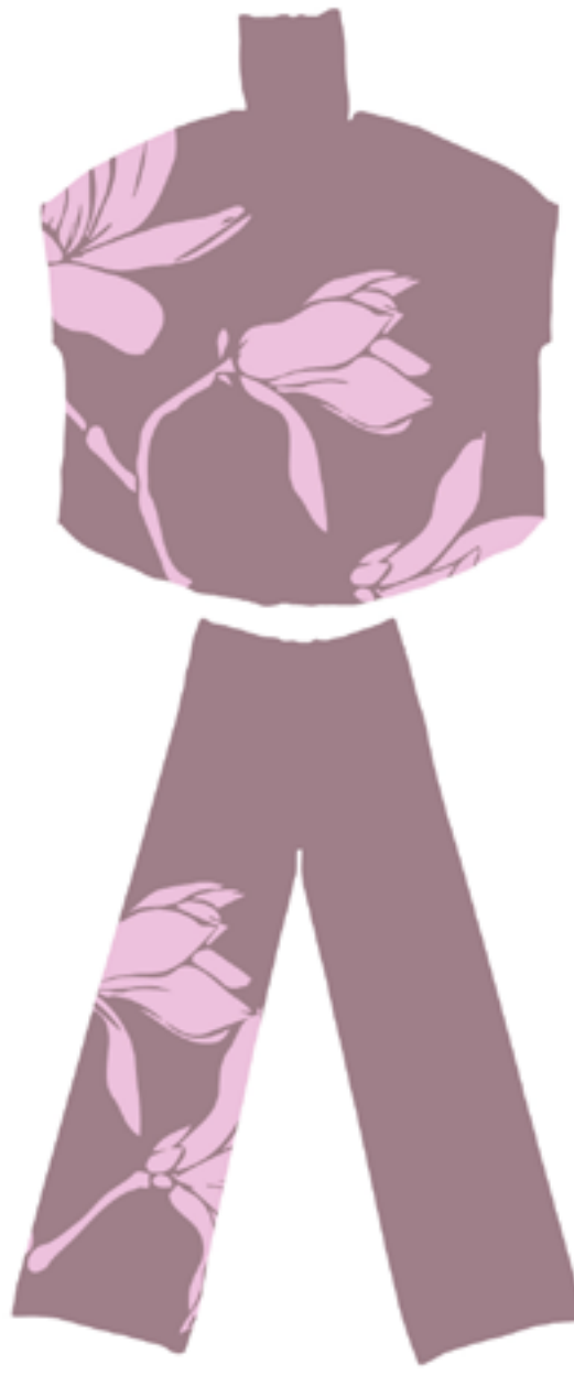
CASACCA art. CC4037A - var. MALVA PANTALONE art. CC4038B - var. MALVA